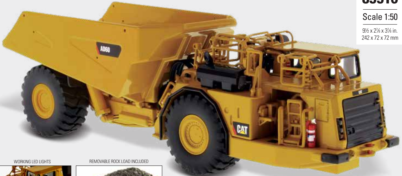
WORKING LED LIGHTS